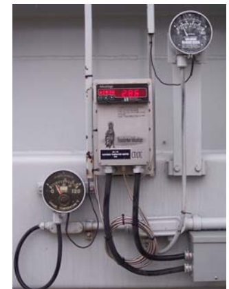
Transformer gauge retrofits