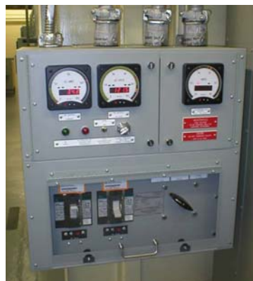
Auxiliary power panels