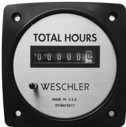
BH-351 with reset