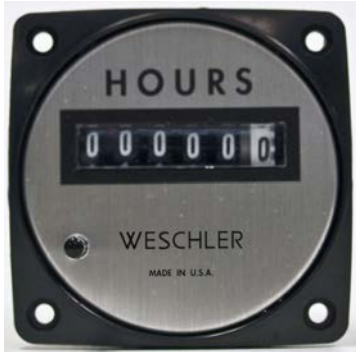
GH-332 with reset