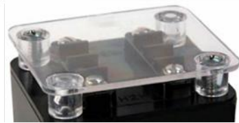
Clear Plastic Cover