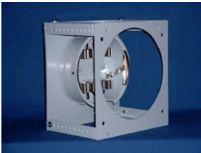
Adjustable Flush Mount Adapter (SWAAF9)