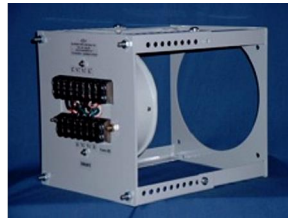
Fully Expanded Adapter (SWAAF9)