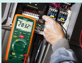
Voltage check on motor starter