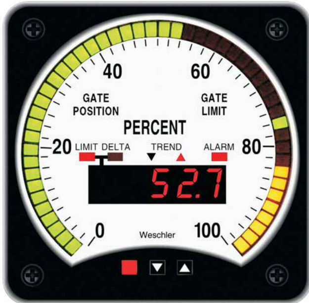
BG241 GPI with optional Trend & Alarm functions. Green bar indicates gate position. Yellow bar indicates gate limit. Single illuminated segment shows the adjustable alarm level.

The Weschler TriColor BarGraph Gate Position Indicator (GPI) provides a rapid visual display of gate position and gate limit. The GPI also gives a precise digital readout of either signal or their difference. Bar colors for position and limit are user selectable (red, green or yellow). Overlap defaults to the third color. Two relay outputs are available. One is tied to the gate limit value. The second is user adjustable and indicated by front panel annunciators. Optional trend LEDs show the direction of gate movement.