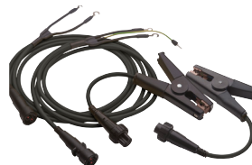
+ KC1 Kelvin clip 3 m leads