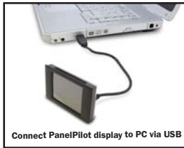
Connect PanelPilot display to PC via USB