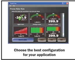
Choose the best configuration for your application