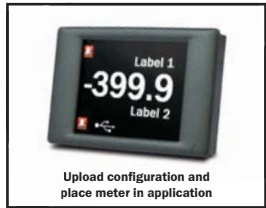
Upload configuration and place meter in application