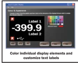
Color individual display elements and customize text labels