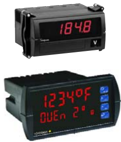
Digital Panel Meters

Weschler Instruments offers an extensive line of meters and testers for metal processing and plating. Popular items include digital panel meters, digital bargraph meters, analog panel meters, digital and analog meter relays, process controllers, clamp meters, multimeters, shunts, current transformers, and process sensors.