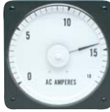
Analog Panel Meters