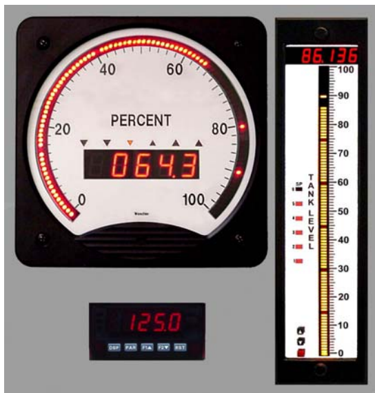
Large Process Indicators compared to typical 1/8 DIN meter