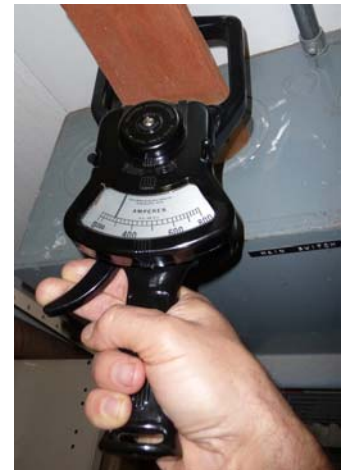
DC bus measurement with large jaw Tong Ammeter