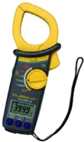
AC/DC Clamp Meters to 3,000 A