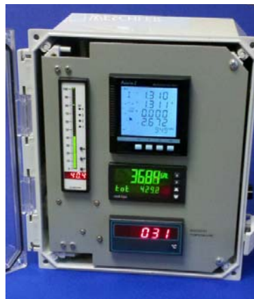
Custom meter cluster for temperature, flow, level & energy measurement