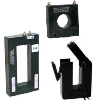
AC Current Transformers to 6,000 Amps

Weschler distributes a wide range of products to sense, measure, display, transmit, control and record power and process signals. In addition to our own products, we carry over 50 leading manufacturers, so we can recommend the solution that best fits your application. We operate a full-capability Meter Modification Center to satisfy special meter requirements. Our large inventory of parts allows us to quickly perform modifications on all major brands of analog and digital panel meters. These include special ranges, special resistances and custom dials for analog meters. Typical digital modifications involve scaling the input, installing setpoint relays, adding digital communications and meter programming.