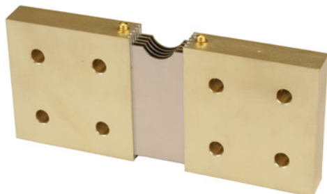
Type E ▲