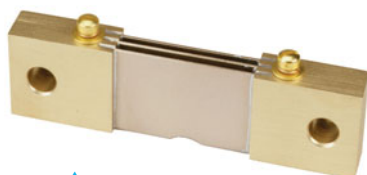
Type A ▲