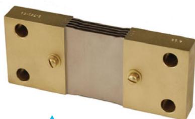
Type B ▲