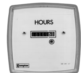
Elapsed Time Meter ▲