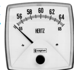
Frequency Meter ▲

* Alternate voltage rating 200-250V use code RN instead of PN