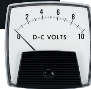
Big Look 250/254